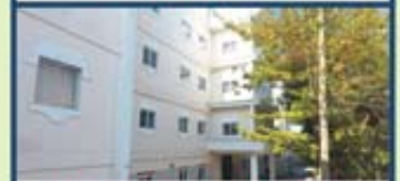
Mehboob Fatima Girls Hostel