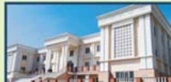
Qadiria Girls Section