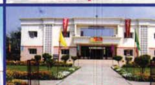
Institute of Management Studies