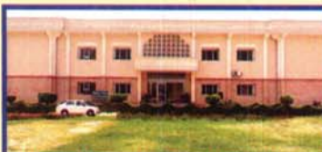
Islamic Research & Training Institute