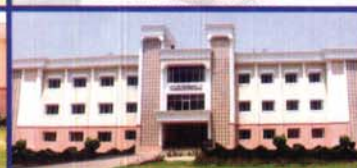
Institute of Education (B.Ed.)