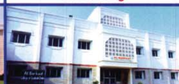
College of Graduate Studies