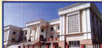
Qadiriya Girls Section